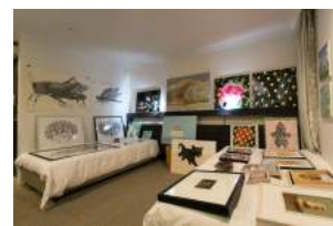
6312 Sansiao Gallery / MASATAKA CONTEMPORARY