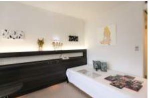
6015 GALLERY TARGET