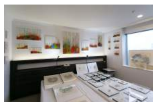
6299 Gallery KAZE