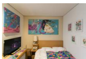
6124 TALION GALLERY