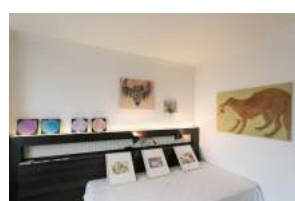
6210 GALLERY IDF