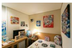
6223 GALLERY APA