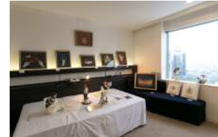
6004 Yorozu Gallery