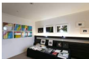
6303 Yoshiaki Inoue Gallery