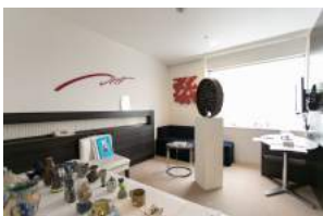
6106 Finch Arts