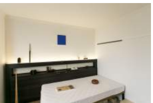
6307 SHUMOKU GALLERY