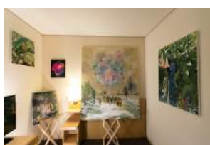
6122 MORI YU GALLERY