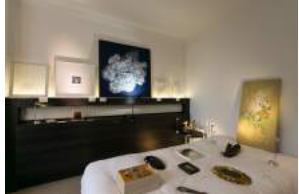
6010 Röntgenwerke AG