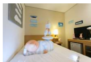
6123 JILL D'ARTGALLERY