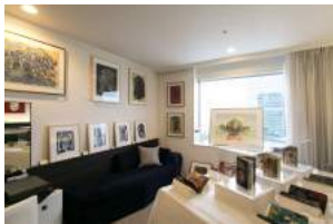
6005 Galerie Miyawaki