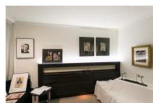
6309 LAD GALLERY