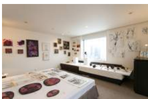
6019 Osaka University of Arts