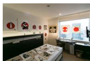
6209 GALLERY KAWAMATSU