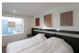
6302 GALLERY RIN