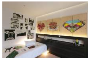
6014 hpgrp GALLERY