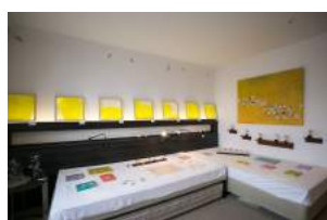
6212 GALLERY APA