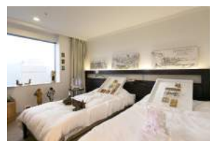
6304 ARTCOURT Gallery