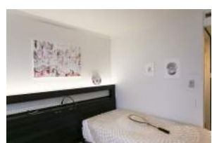
6297 Gallery Hosokawa