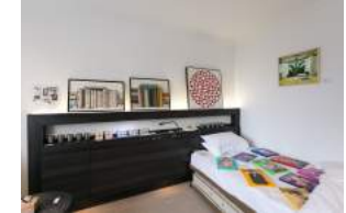
6012 MEGUMI OGITA GALLERY