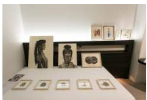
6310 studio J