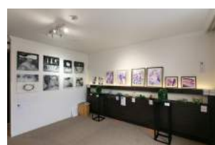
6217 DMO ARTS