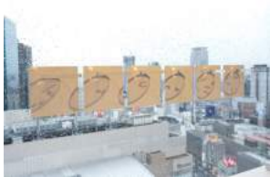
6009 Gallery Yamaguchi kunst-bau