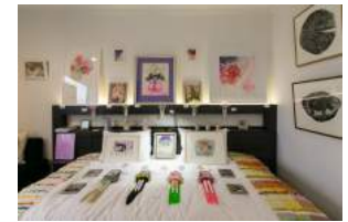
6008 SHINOBAZU GALLERY