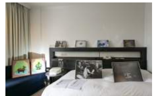
6017 Galerie Grand Siècle