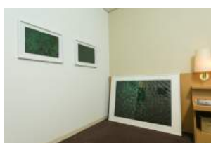
6121 The Third Gallery Aya