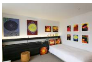
6216 Gallery Godo