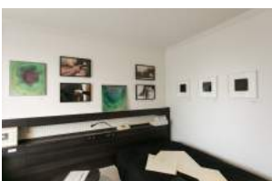
6105 TALION GALLERY