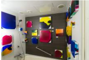
6001 Gallery OUT of PLACE