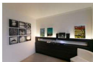
6298 POETIC SCAPE