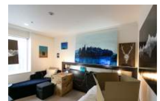
6103 MORI YU GALLERY