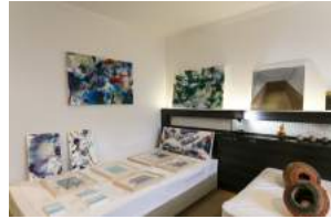
6002 Note Gallery