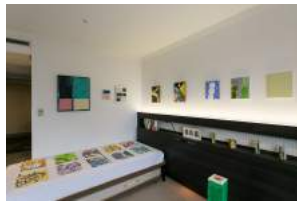
6007 KOKI ARTS