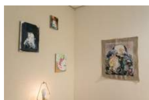
6125 Finch Arts