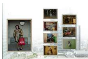
6102 The Third Gallery Aya