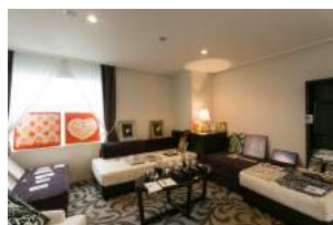
6119 Keumsan Gallery