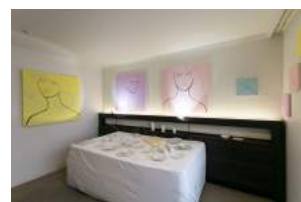
6305 AKI GALLERY