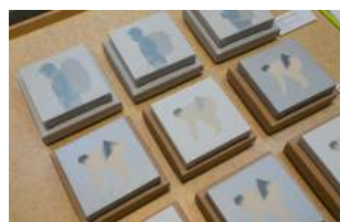
6225 Nii Fine Arts