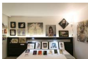
6317 JIRO MIURA GALLERY