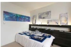
6104 JILL D'ARTGALLERY