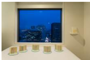
6315 YUKIKO KOIDE PRESENTS