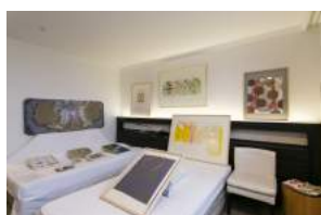
6316 Tachibana Gallery