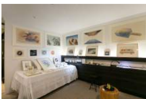
6311 Gallery Artzone Kaguraoka