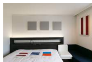
6308 Gallery Shilla