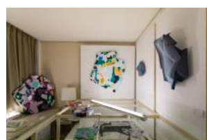
6227 DMO ARTS