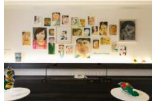
6003 gallery incurve kyoto