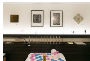
6314 YOD Gallery