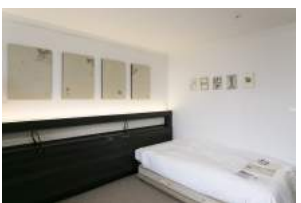
6306 GALLERY KOGURE