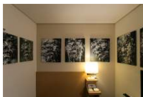
6226 Gallery Godo