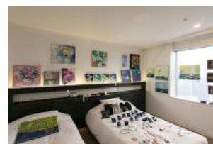
6214 AP Gallery