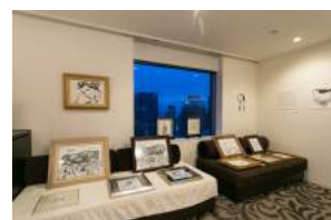
6319 TEZUKAYAMA GALLERY