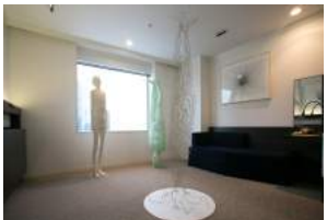
6006 Gallery Nomart