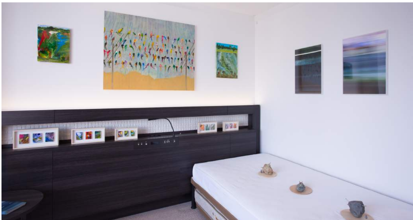
A. KOKI ARTS, ART OSAKA 2017

We will be exhibiting and selling the 54 gallerists' hand-picked contemporary artworks!