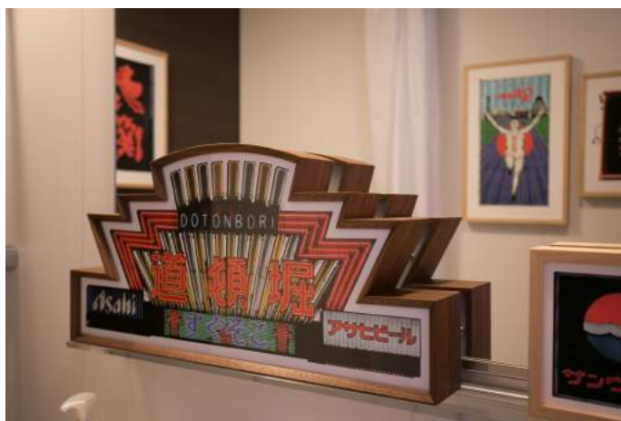
C. LAD GALLERY, ART OSAKA 2017