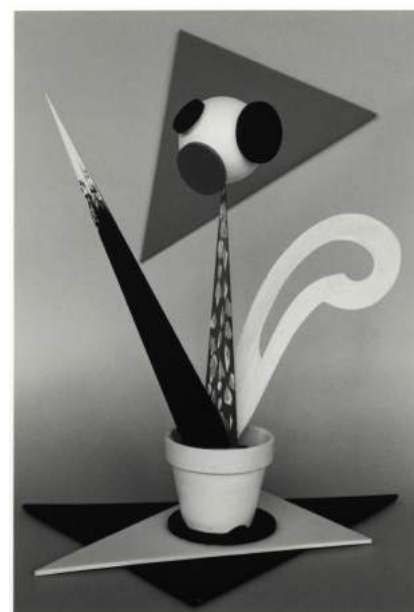
8. Yasumasa Morimurai 《Barco negro na mesa Geometry's Flower 1》 Gelatin silver print 1984