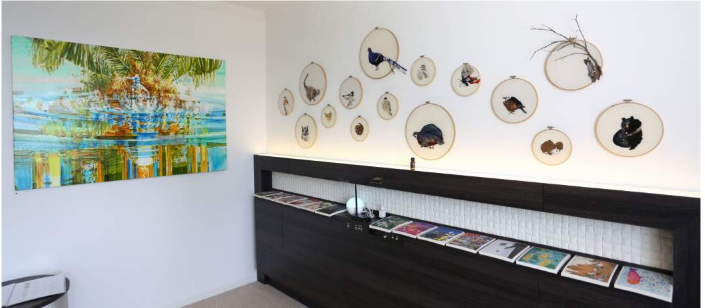
A. ART OSAKA 2016 YIRI ARTS