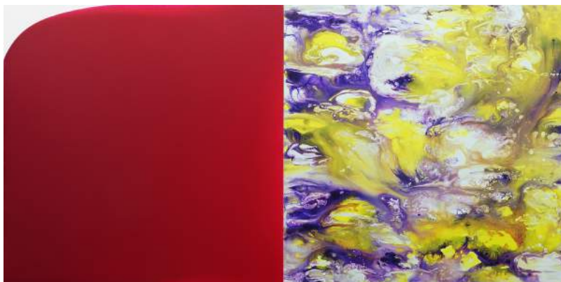
3. nakajima mugi 《WM_M+blue_on_blue》 acrylic on canvas 2014 – 2017