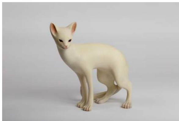
2. Yoshimasa Tsuchiya 《Cat》 wood caving, borosilicate glass, polychrome 2017