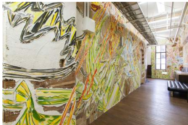
4. Satoshi Kawata 《Circles, Crosses and Triangles of Summer》 Wood, wire mesh, mortar, pigment and others 2015 Installation at Kyoto Art Center