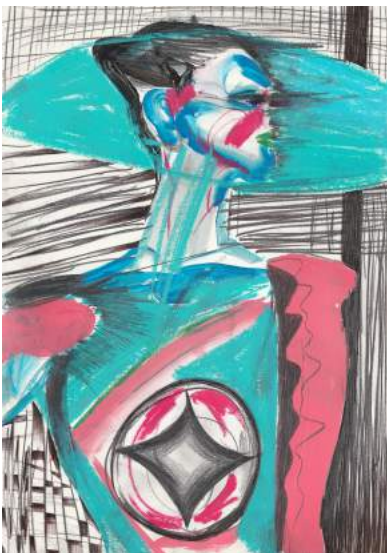
1. Genta KOSUMI 《Untitled》 Pencil, Crayon, Pen, Acrylic on paper 2017

*Please note that artworks presented in the fair may change without notice.