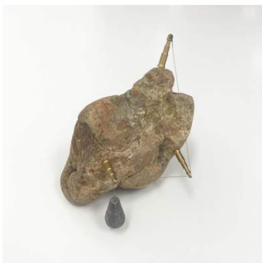
6. Morio Shinoda 《No. 17》 stone, brass, stainless 2016