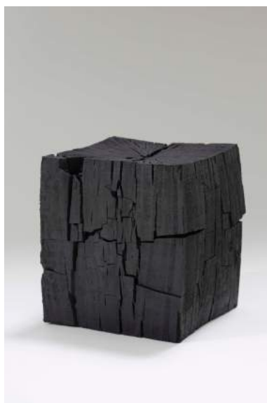
7. Katsuhiko Narita 《SUMI》 Charcoal 1968