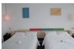
Room.911 MEGUMI OGITA GALLERY