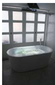
Room.908 gallery ARTE