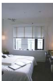
Room.906 Gallery TAF