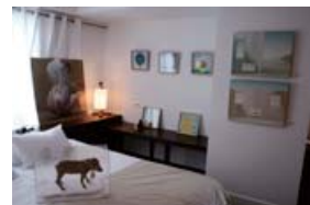
Room.817 Keumsan Gallery