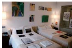
Room.816 Gallery KAZE