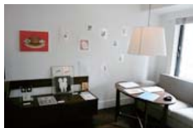
Room.812 gallery Sakamaki