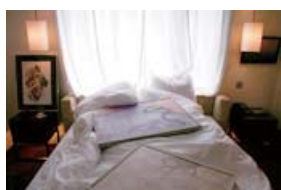
Room.918 YOKOI FINE ART