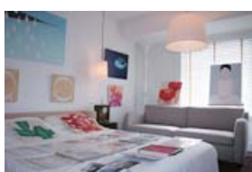
Room.915 GALLERY TSUBAKI