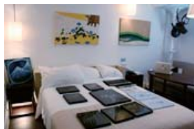
Room.815 FUKUGAN GALLERY