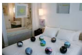
Room.902 HIRO GALLERY