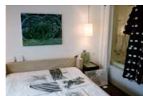
Room.905 ARTCOURT Gallery