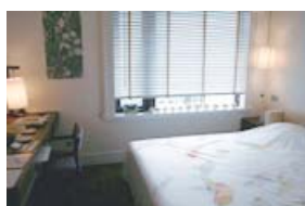
Room.901 Gallery Hosokawa