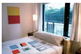
Room.818 Gallery Yamaguchi Kunst-Bau