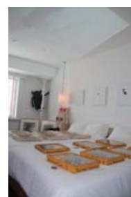
Room.910 Art U room