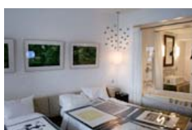
Room.912 Nomart Project Space